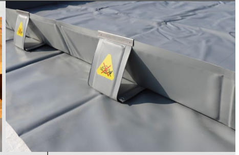
Detail of lateral reinforcements