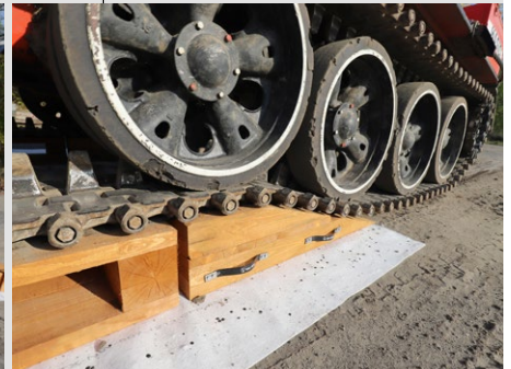
Detail of tracked vehicle entering the wooden ramp