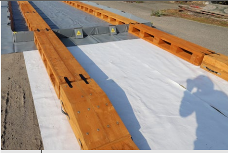
Pool with wooden ramps