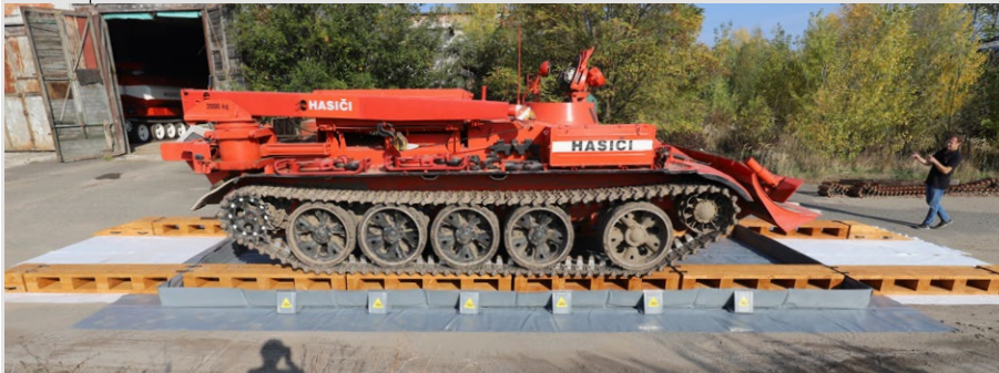
Examples of uses