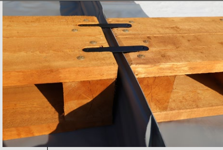
Detail of anchorage of a wooden ramp