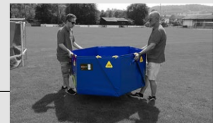
Manipulation with Hexagon