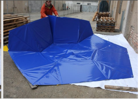
The whole tank can be erected by a single person in minutes