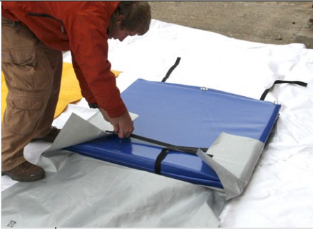
The tank can be packaged to surprisingly small dimensions