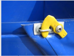
After erecting the hexagonal tarp is fixed with special fastening hooks