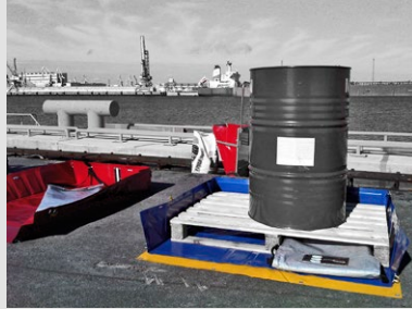
Detail of collapsing the corners