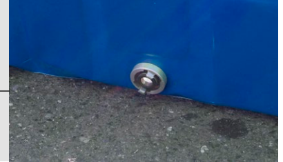
Possibility of adding of drain hole and ball valve

The corners are not sealed and so the tarp can easily fold around the pallet