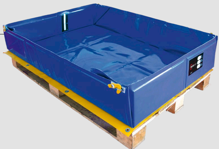
Cargo EUR without the handles

Thanks to shape and size specially designed for use in industry and transportation