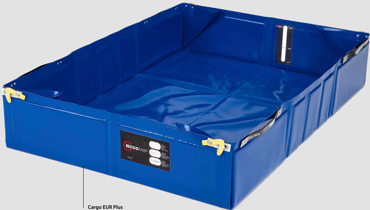
Cargo EUR Plus with side handles