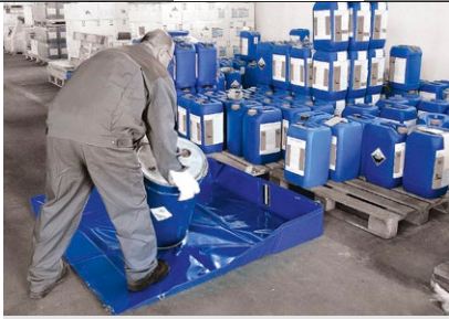
Examples of use