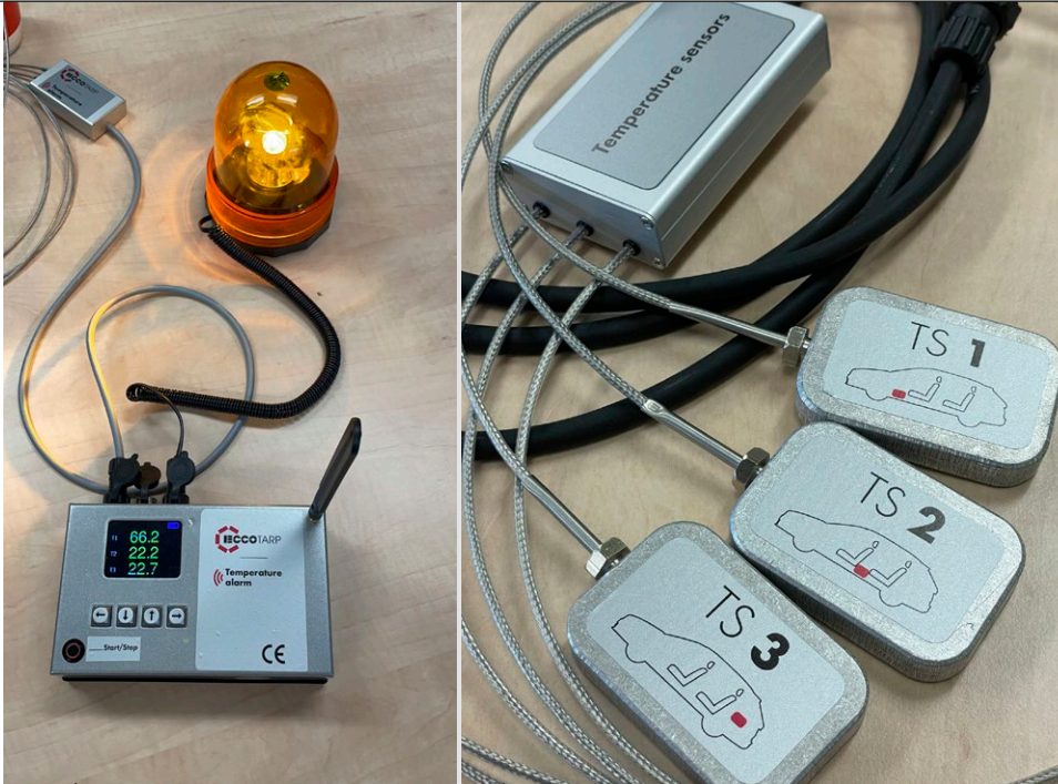
Beacon announcing the exceeding of the specified temperature