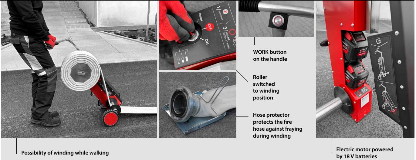
Possibility of winding while walking