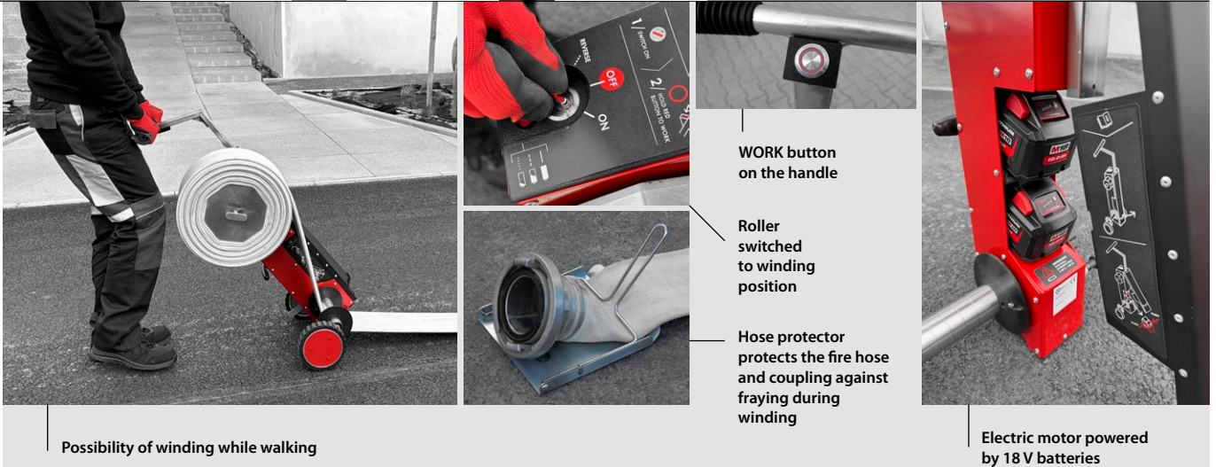
Possibility of winding while walking