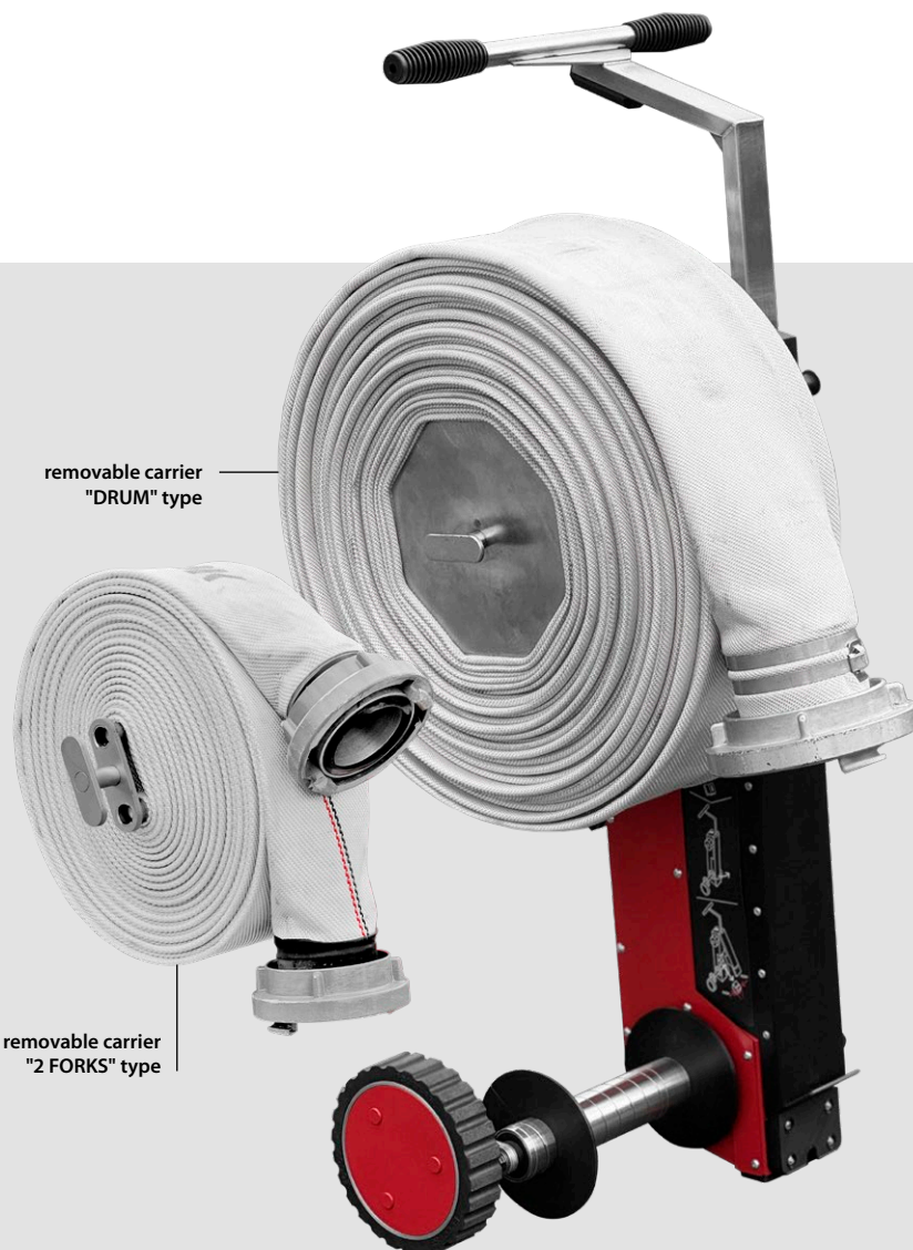
removable carrier "DRUM" type